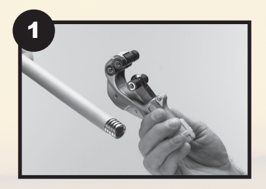
Cut tubing and remove PE coating to expose 4 corrugations.