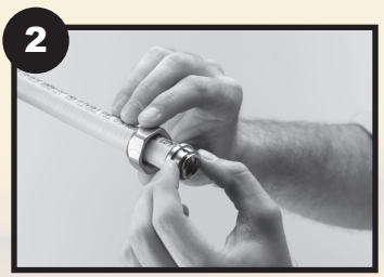
Slide nut over tubing, place retainer ring leaving one corrugation exposed.