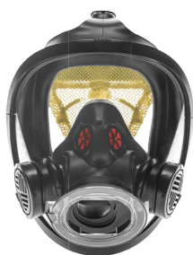
AV-3000 HT FACEPIECE