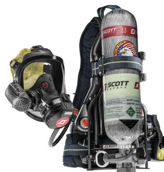
AIR-PAK X3 SCBA