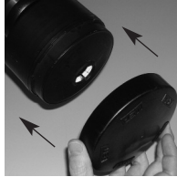
motion for attaching spark cover