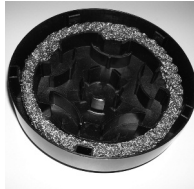
check for optional spark arresting material