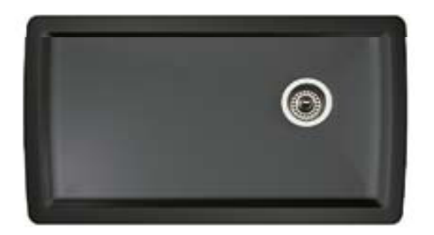
Model 441768 shown